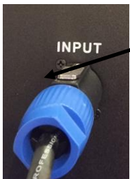
Passive Speaker Input